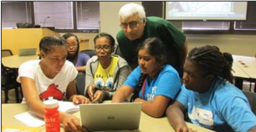
Girls Inc. of Central Alabama partners with UAB every summer to offer a multi-week camp focused on growing interest in the fields of science, technology, English and math.